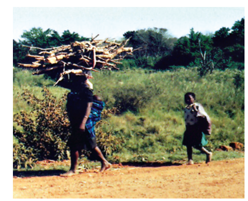
Firewood collection: drudgery for women and children