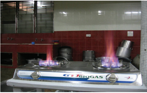
A Biogas Stove